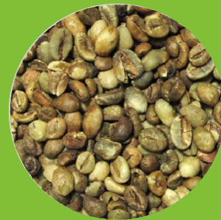
LAMPUNG GRADE 2