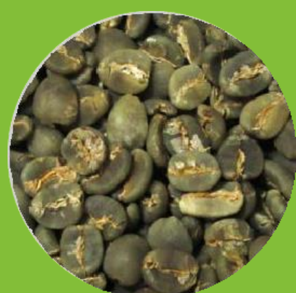
SUMATRA ARABICA ORGANIC GRADE 2