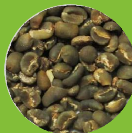
FLORES GRADE 1