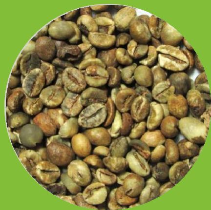
LAMPUNG ELB 450 BC