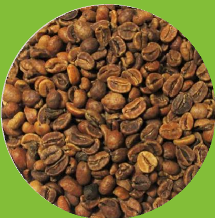
BALI, JAVA, GAYO AND MANDHELING WINE