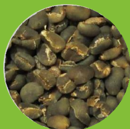
TORAJA GRADE 1