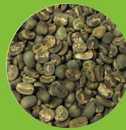
MANDHELING HIGH GRADE