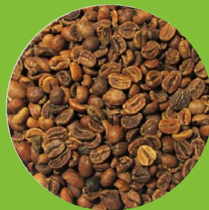
BALI, JAVA, GAYO AND MANDHELING WINE